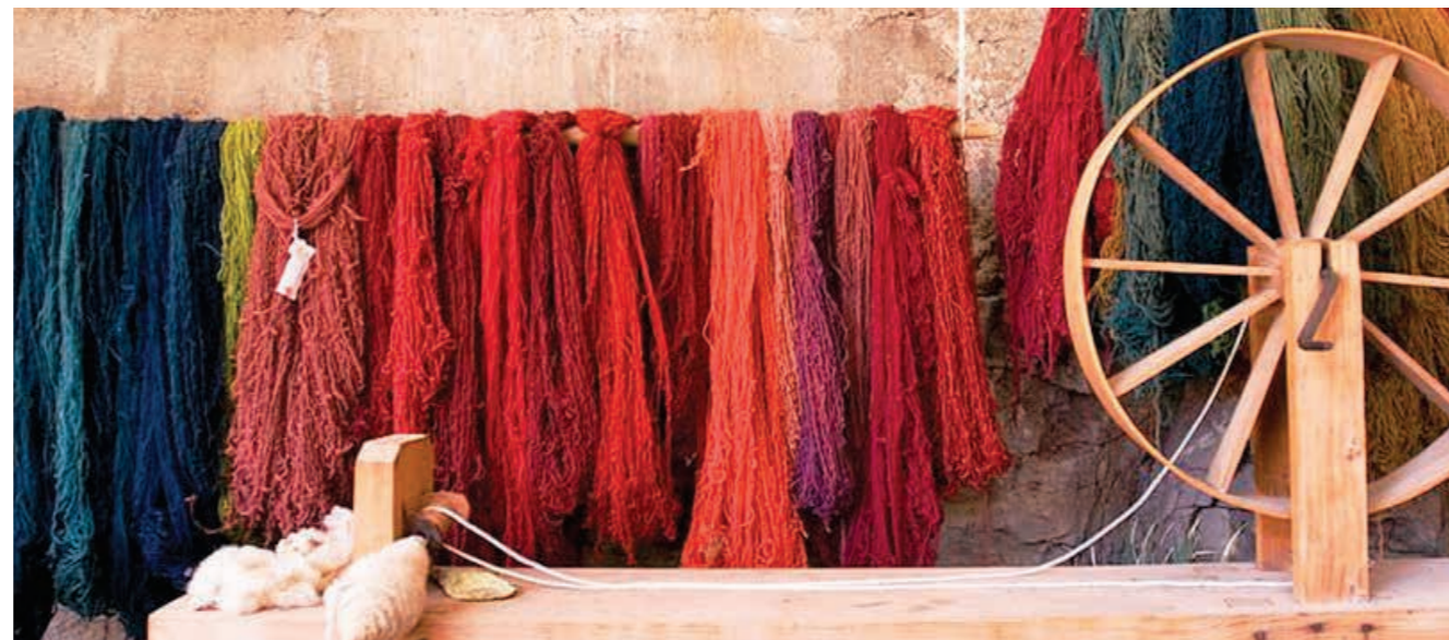
Yarn dyed using natural ingredients.

Weaves, threadwork and textile decoration, among other indigenous crafts spin yarns—even if coloured with the emotions of the artisans—describing the local life. Influenced deeply by the local socio-economic-political environment, but also linked to moments of celebration, like festivals and weddings. The craft, in