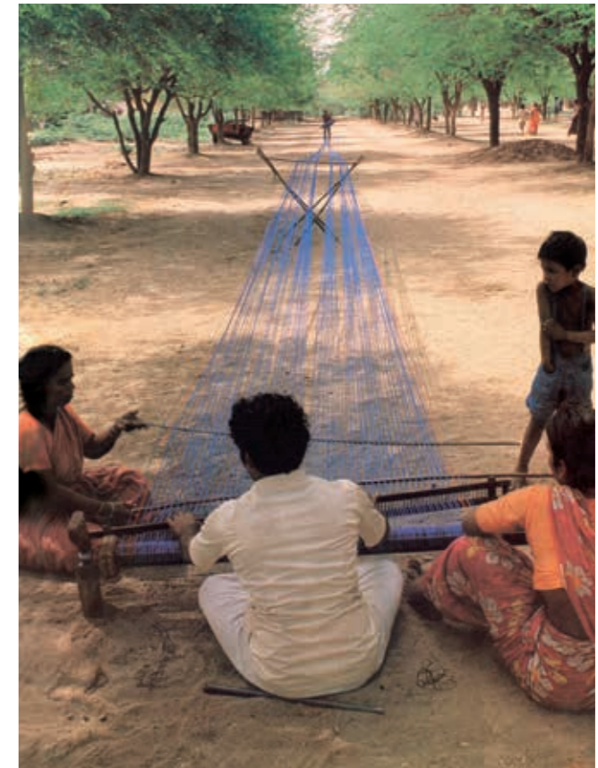
A family weaves together.

Vasudev points out that the general awareness of what sustainability in