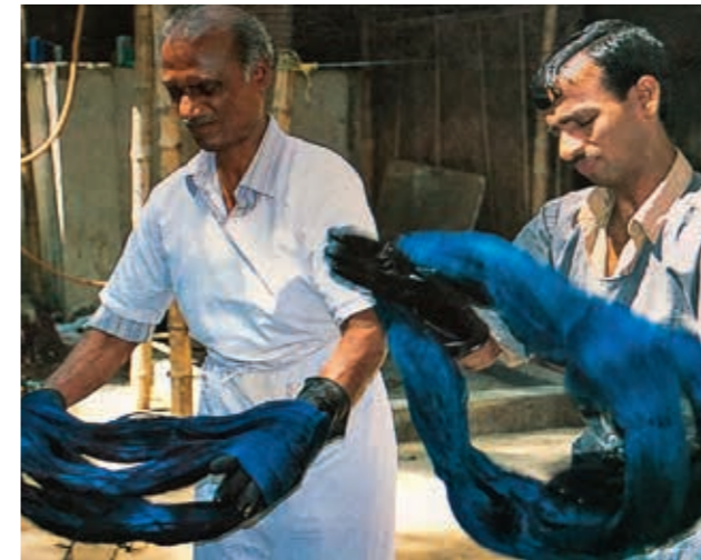
Indigo dyeing skeins of yarn.

fashion means is very poor, and it slants merely towards that which is organic and natural. She believes that to say India is realigning itself towards sustainability would be a premature remark because the masses are not aligned with it. "The sustainability manifestos are lost; they have to be brought together and pushed in a contemporary format and I do not see that happening very much, even as the sustainability argument is staggered with clued-in fashion designers and manufacturers," says Vasudev.