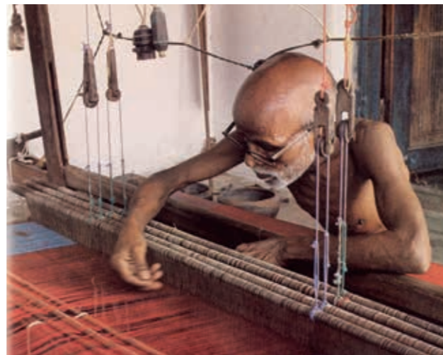
The frames and lots of a loom.

And yet, today, approximately 120 billion square metres of fabric end up as waste in India, China and Bangladesh alone, not including garment rejections during quality checks. Knowing this, Delhi-based Kriti Tula of label Doodlage says she upcycles up to 600 kilograms of waste fabric every month. Designers like Karishma Shahani Khan, the founder of Pune-based label