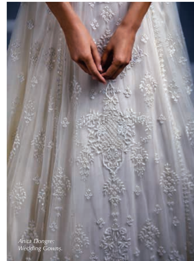
Anita Dongre: Wedding Gowns.

The gara style of embroidery on traditional Parsi saris had been losing popularity and been replaced by machine-made versions—due in part to the diminishing Parsi community and the painstaking process—until there was a renewed