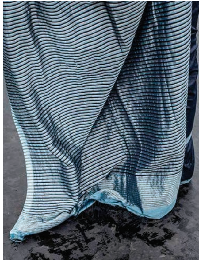
Handloom weaves using real zari.