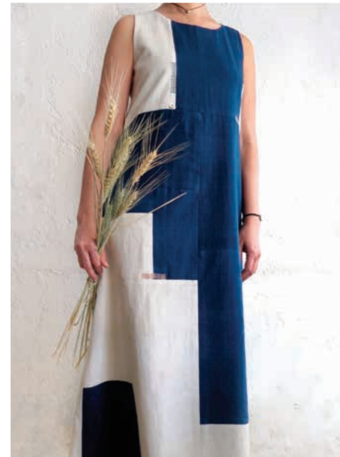
Kishmish: Block dress in indigo and kora khadi.

As handloom hits the runway, one may also credit the persistent and long-standing efforts of conscious designers. to revert to traditional techniques.