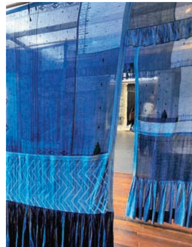
A three shuttle indigo-dyed sari.