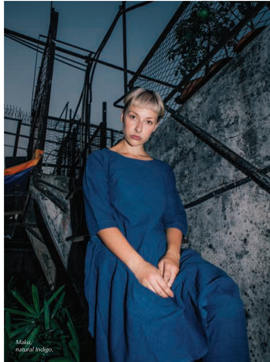
Maku, natural Indigo.