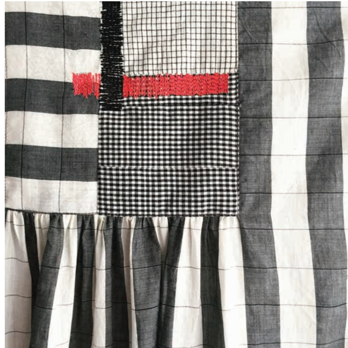
Kishmish specialises in