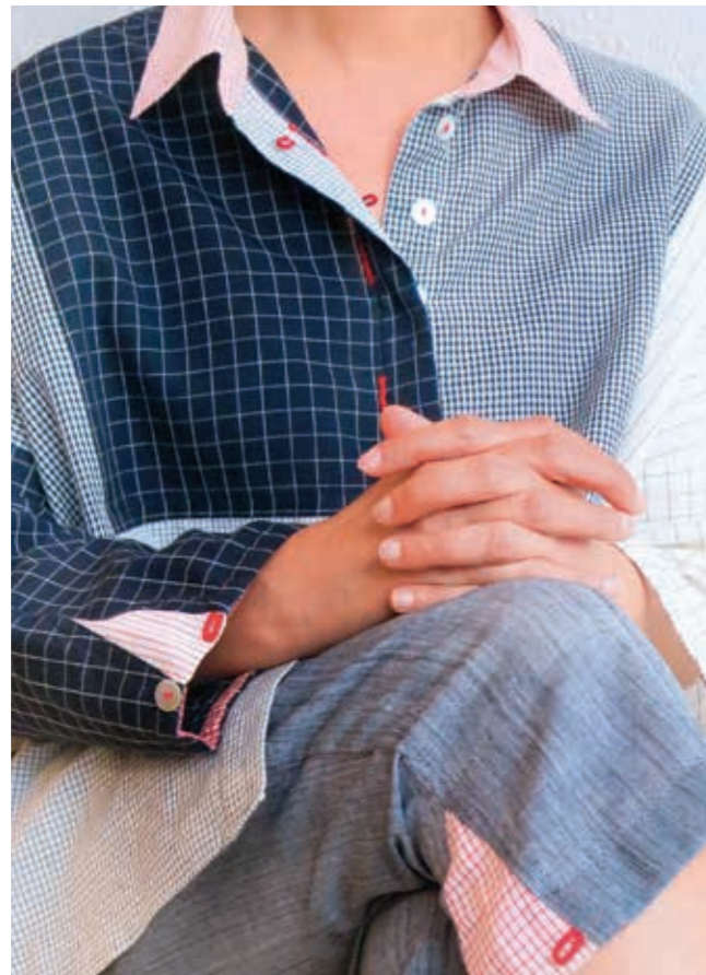
Kishmish: T-shirt and pyjamas in handwoven cotton.

There has been a shift to acrylic yarns and fabrics for weaving instead of the traditional cotton, silk and wool, with a mutation of woven designs.